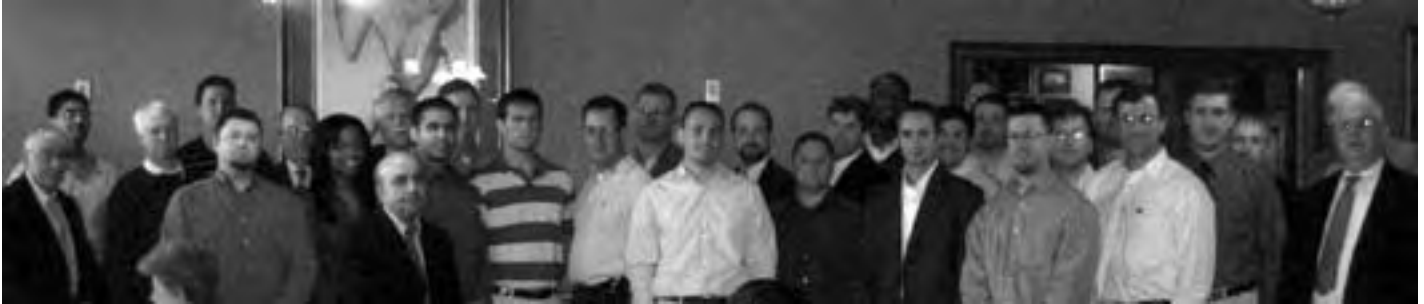
New licensees were presented with certificates and honored at a luncheon in Baton Rouge.