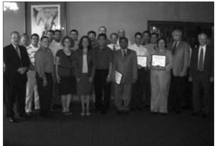
New licensees at the Certificate Presentation Ceremony with representatives from LAPELS, LSPS and LES.