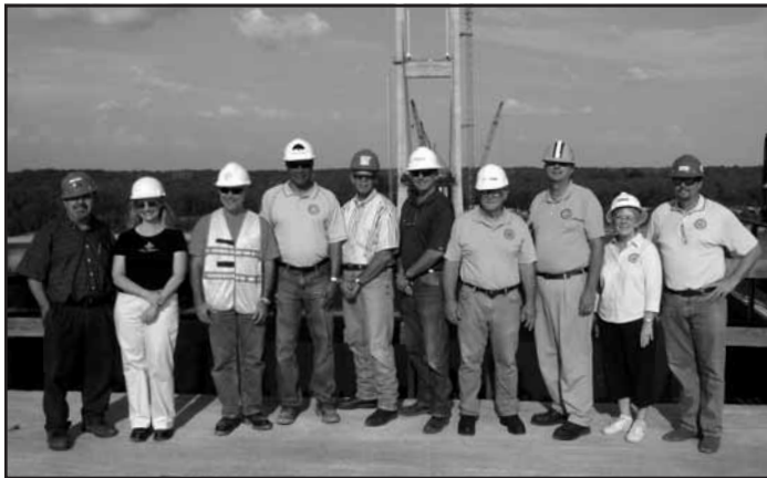
LAPELS board members visit the John James Audubon Bridge Project.