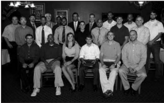
Congratulations to these newly certified and licensed individuals.

Jones Environmental, Inc. TRC Engineers, Inc.